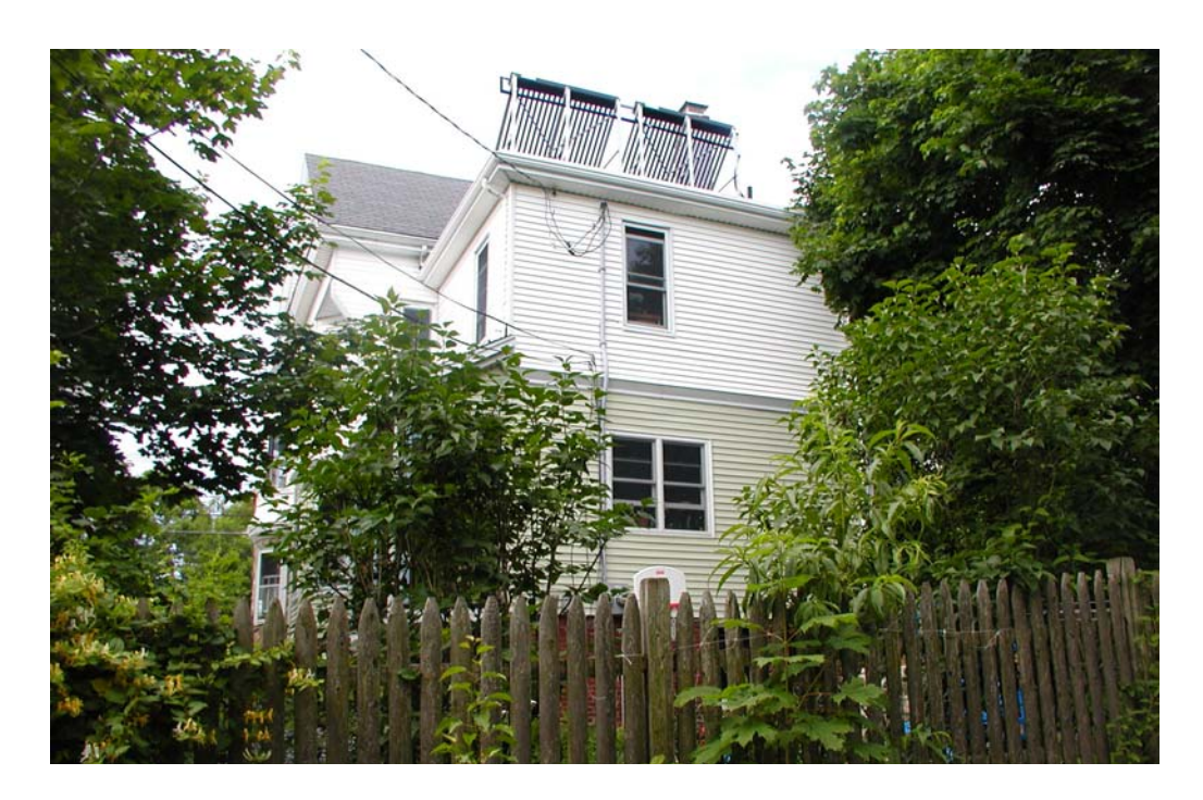
Existing Rear Façade